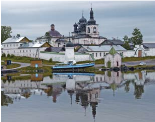
Goritsky boasts the Monastery of St. Cyril on the White Lake.

Catherine remains the fodder for many a father-daughter conversation, but if you aren't blessed with a Russian-speaking father, and don't want to tackle Russia solo, there are options. For many, the river cruises that ply the Volga and Svir Rivers between Moscow and St. Petersburg are the ultimate convenience, with lectures and guided tours. But the real upside may be the visits to the quaint but ornate riverside villages. It's a window into a different Russia, particularly Uglich, founded in 1148 and used by Ivan the Terrible as a base for his campaigns against the Golden Horde, and Kostroma, considered the home of the Romanov royal family. Yaroslavl stretches along both banks of the Volga, and Goritsky boasts the Monastery of St. Cyril on the White Lake, one of Russia's oldest and most famous. Walk around the Island of Kizhi to see the wooden architecture that's typical of northern Russia brought to life in wooden churches, bell towers, peasants' homes, granaries, barns, windmills and bathhouses. Mandrogi, a small village rebuilt on the bank of the River Svir, lets you experience Russian life in the provinces as you watch artisans and craftsmen at work.