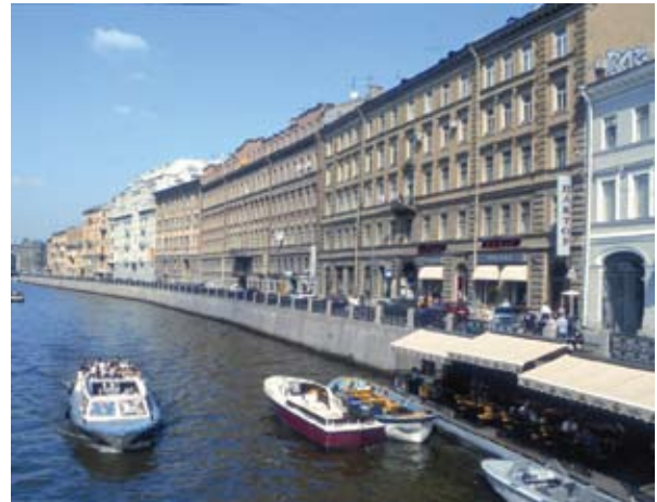
A picturesque view of a St. Petersburg canal.

River Cruises: www.cantrav.ca , www.exclusivetours.ca